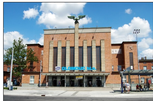
Olomouc Main Train Station