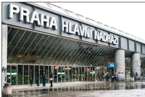
Prague Main Train Station